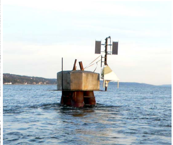
Seamark in Oslofyord (Norway)